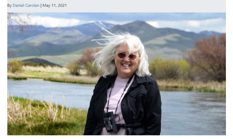
Read more on usu.edu